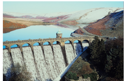
Water management is one sector where decadal forecasts would be particularly useful.

The examples are endless and potential economic and social benefits immense.